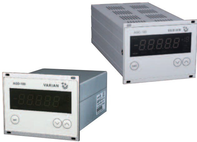
Outline Drawing AGC-100 and AGD-100